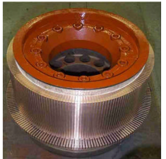
An Example of a Machined Commutator

UK sole agents for TriTool Inc. Portable Machine Tools