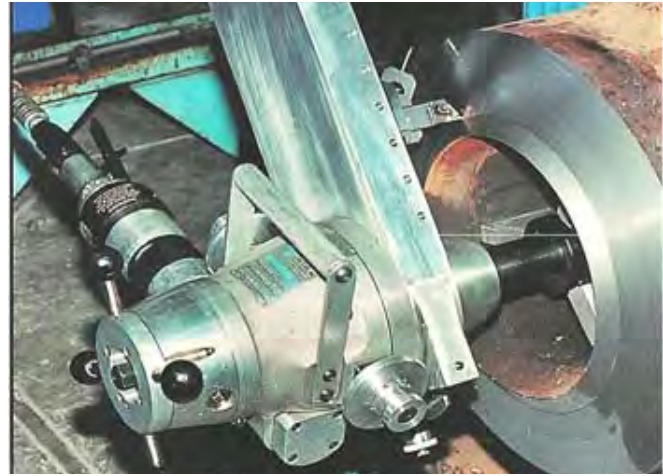
An end prep being carried out on a thick wall tube using an I/D mount