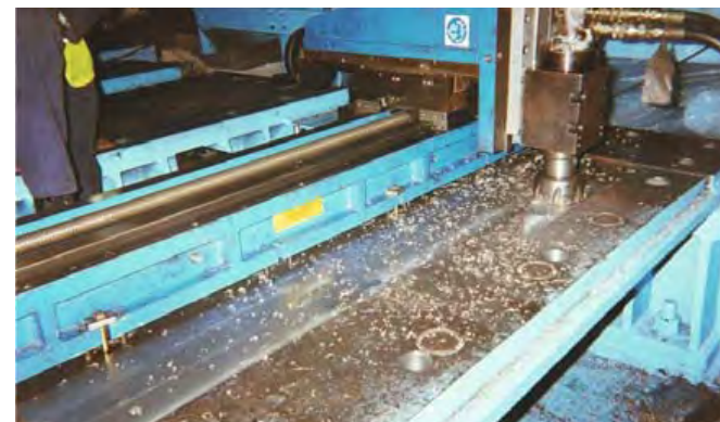
Milling of a 2.5M long pedestal base for a wheel testing machine at Dunlop