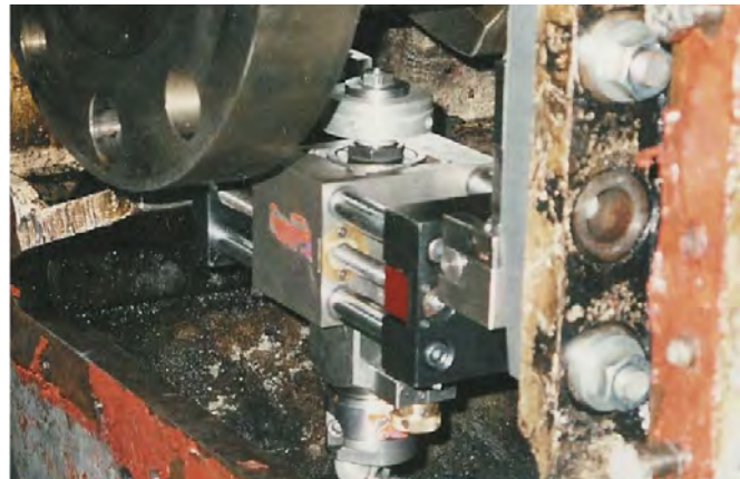
Mounting the "Millgrind" Equipment on a 400mm Ø Main Journal

Visit our Crankshaft website www.crankshaftgrinding.co.uk